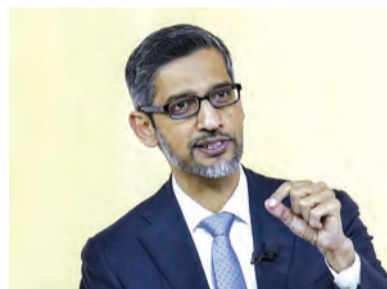
Google CEO Sundar Pichai speaks during the Google AI event in New Delhi

Pichai underscored that AI adoption must prioritise trust, safety, and inclusivity. "AI must work across languages and local contexts. It must deliver