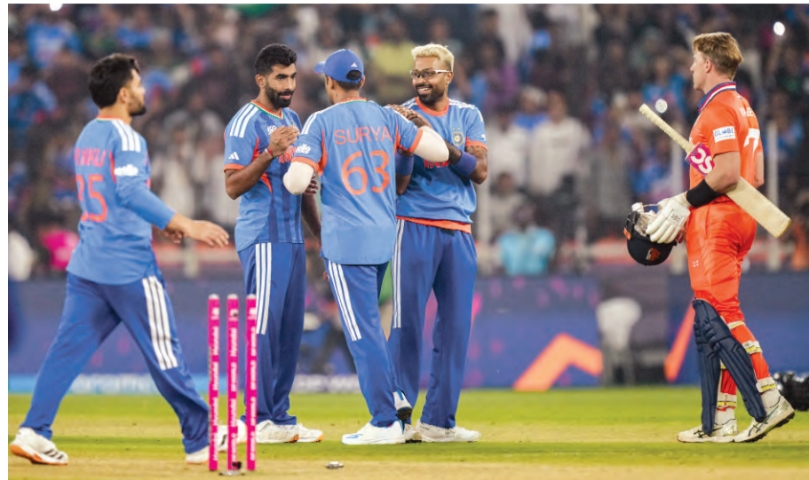
India's players celebrate after winning the ICC Men's T20 World Cup 2026 cricket match between India and Netherlands