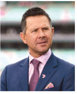
that sort of aura around it that a lot of other Australian teams have going into ICC events and World Cups," Ponting said. "You need to have your best players and your most

Former captain Ricky Ponting says the current Australian side lacked the aura that defined its past teams at global events and termed the country's early exit from the men's T20 World Cup as a "really poor campaign". Speaking on the latest episode of the ICC Review, Ponting said the team on paper did not carry the same presence as previous Australian outfits that dominated ICC tournaments. "You look at that Australian team on paper, it just doesn't look to have