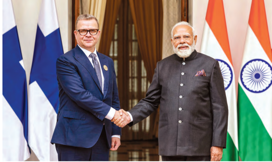
Prime Minister Narendra Modi meets Prime Minister of Finland Petteri Orpo, at Hyderabad House, in New Delhi

Calling the agreement "historic," Modi said it would unlock sweeping new opportunities for businesses, workers and innovators across both nations. He underscored that the pact is not symbolic diplomacy but