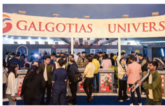
Visitors at the Galgotias University stall during the AI Impact Summit, at Bharat Mandapam, in New Delhi