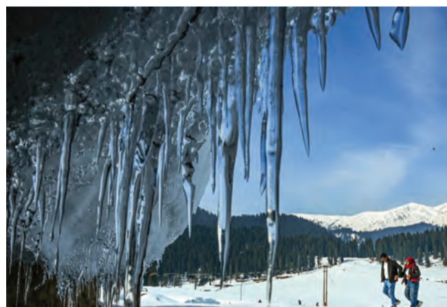
Tourists walk through a snow-covered area with hanging icicles in Doodhpathri, a tourist destination in Budgam, Jammu and Kashmir.