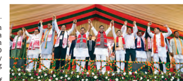
Assam CM Himanta Biswa, BJP National President Nitin Nabin, State party President Dilip Saikia and others during a public meeting in Dibrugarh on Wednesday

BJP national president Nitin Nabin on Wednesday set a target for party workers in Assam to secure at least 50 per cent of the votes in every booth in the upcoming Assembly elections. Accusing the Congress of using Assam as a land for "vote bank politics", he said the