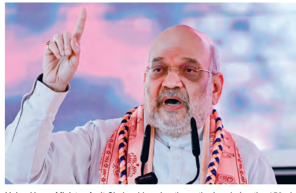
Union Home Minister Amit Shah addressing the gathering during the 152nd birth anniversary celebrations of Sri Bhaktisiddhanta Saraswati Thakur Ji in Nadia, West Bengal on Wednesday