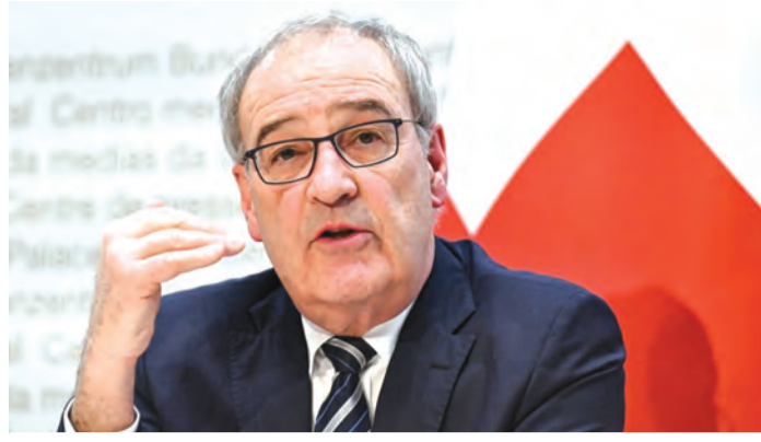
Swiss President Guy Parmelin

potential of AI, and that no one is left behind," Parmelin said. "The principles established by the summit in India in this regard provide useful guidance, and the structures for voluntary cooperation established in New Delhi provide structure that can help us achieve this goal," he said. The Swiss president is among around 20 global leaders attending the ongoing AI Impact summit in New Delhi that is largely being seen as an evolving international goal to strengthen cooperation on the governance, safety, and societal impact of artificial intelligence. He also addressed concerns over possible impact of AI on developing countries especially on challenges to protect their labour markets from 'AI-driven dumping'. "When AI significantly reduces production costs in high-wage countries, exports can become so