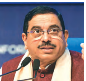
Union Minister Pralhad Joshi

Integration of AI-driven technologies can be useful in managing the stability of the grid in India, where capacities are being added on a large scale, Union Minister Pralhad Joshi said on Wednesday. Speaking on the sidelines of the ongoing AI Impact Summit here, the New and Renewable Energy Minister said projects are being added in gigawatts. Sometimes during the solar hour, the generation will be more and sometimes because of the weather, it comes down also. At that time, grid stability will become an issue, Joshi