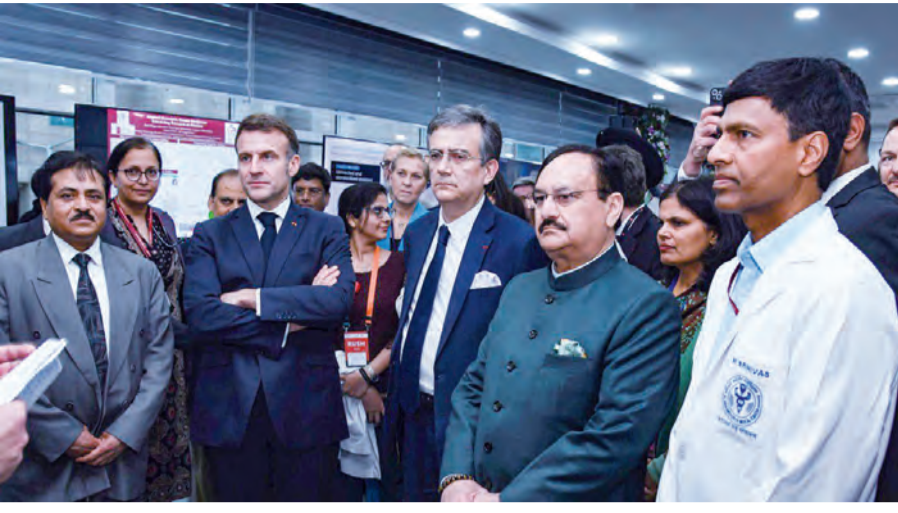
Union Health Minister JP Nadda with France President Emmanuel Macron at AIIMS on the sidelines of the India AI Impact Summit 2026 in New Delhi

technologies created and managed elsewhere," Macron said on the occasion. Emphasising responsible governance, Macron said, "Artificial intelligence must serve humanity — with strong protection for children, transparency in algorithms to address bias, and a firm commitment to preserving linguistic and cultural diversity — areas where India and France share a common vision." He also highlighted the transformative potential of ethical AI adoption across sectors, particularly in healthcare, to enhance productivity and accelerate scientific discovery. Macron also interacted with students and encouraged young researchers to pursue innovation-driven solutions in healthcare. The IF-CAIH is a pioneering initiative aimed at advancing