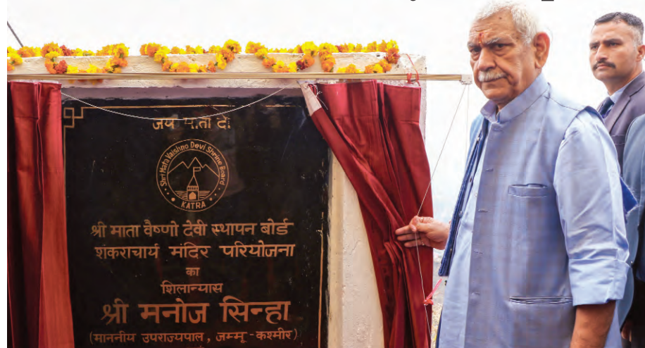
J&K LG Manoj Sinha at the foundation stone-laying ceremony of Adi Shankaracharya Temple, in Katra

During the ceremony, Manoj Sinha said that Adi Shankaracharya undertook a cross-country visit and established four mathas. "He also visited Jammu and Kashmir. A temple of Shankaracharya sit-