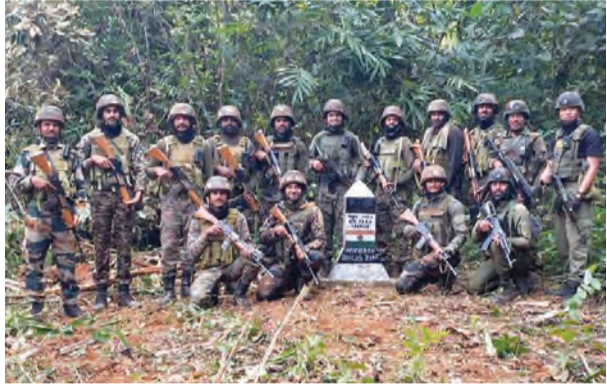
ence of erstwhile insurgent camps. Operating in dense jungle terrain under challenging security conditions, the team cleared and sanitised a corridor measuring 2.6 km x 13 m. During the operation, nine IEDs and two unexploded ordnance were destroyed thereby removing a serious threat to innocent lives. The operation also enabled Survey of India teams and construction agencies to proceed with critical border infrastructure work.

Red Shield Division of the Indian Army's Spear Corps carried out a major area sanitisation and de-mining operation along the Indo-Myanmar Border at Yangoubung, Manipur between Border Pillars 72 & 73 from 16 January to 17 February 2026. The task was undertaken following a requisition from Government agencies to facilitate the resumption of stalled border fencing work amid intelli-