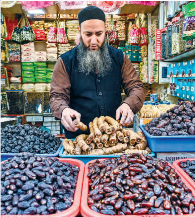
Shopkeeper arranges figs while waiting for customers amid Ramadan festivities in Srinagar