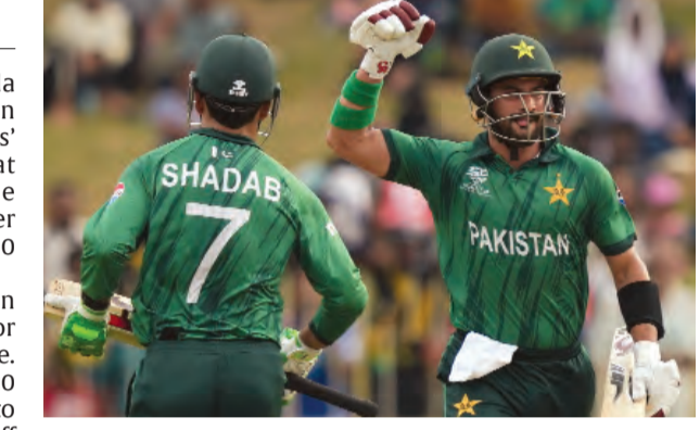
Pakistan's Sahibzada Farhan, right, celebrates his century during the T20 World Cup cricket match between Namibia and Pakistan in Sri Lanka

Pakistan rode on Sahibzada Farhan's scintillating, maiden hundred and their spinners' excellent display to beat Namibia by a handsome margin of 102 runs and enter the Super Eights of the T20 World Cup on Wednesday. Batting first, Pakistan posted a formidable 199 for three in their must-win game. Farhan, who needed just 20 deliveries to move from 50 to 100, ended on 100 not out off 58 balls, becoming only the second player from Pakistan to score a century in the tournament after Ahmed Shehzad's ton against Bangladesh in 2014 at Mirpur. In all, Farhan hit 11 bound-