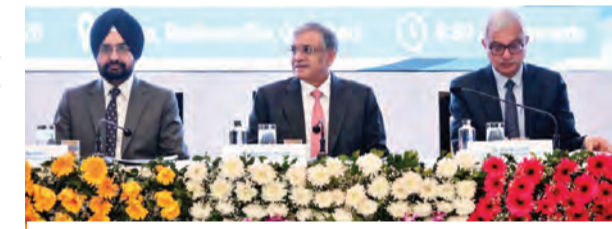
Chief Election Commissioner Gyanesh Kumar and Election Commissioners Sukhbir Singh Sandhu and Vivek Joshi addressing media on Wednesday

Chief Election Commissioner (CEC) Gyanesh Kumar on Wednesday said that the Special Revision (SR) was conducted in Assam with the sole motive of including all eligible and excluding ineligible voters from the electoral rolls. He said that the SR exercise was successful in Assam, with only 500 people from across all districts in the state have submitted appeals for inclusion of their names or exclusion of others. Addressing a press conference at the end of the 3-day